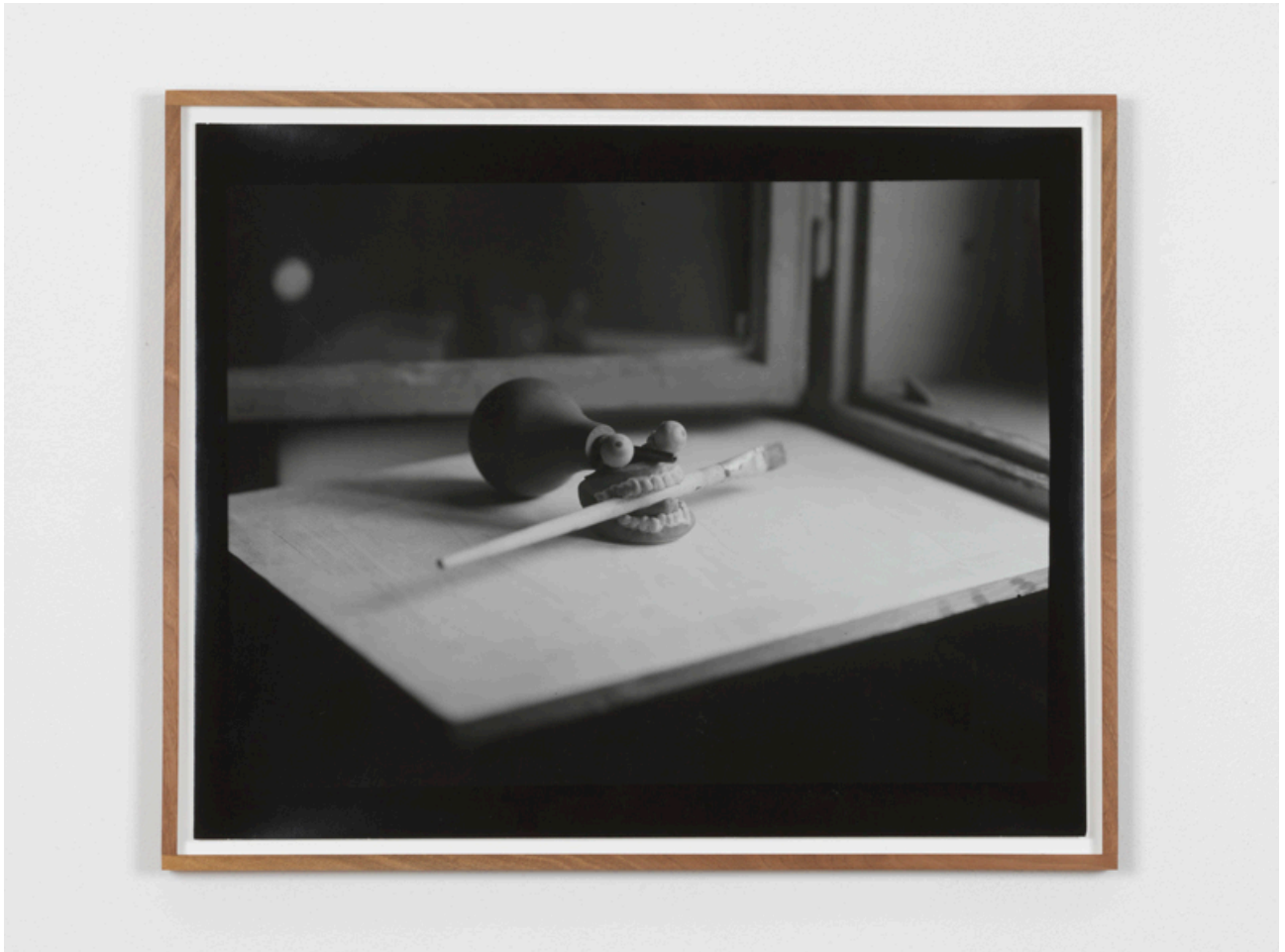
Self portrait , 1996, b/w photograph, cm.46,5x58, Ed.3+2AP.

"The photo shows me as a painter, the way people see painters, namely with big eyes and an empty brain."