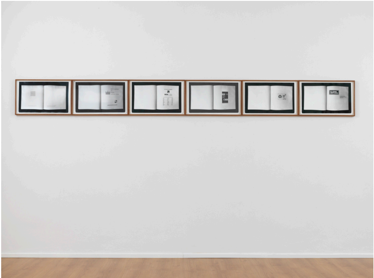
Malerwochen , 1972/1973, series of 6 b/w photographs, 30,3x50,6 cm each, Ed.of 2.

“I signed my name to last pages with advertisements on them in the catalogue VII Internationale Malerwochen 1972 because I wanted to have as many of my own pages as possible in the catalogue. I asked the artist who came last in alphabetic order, Franco Vaccari, to swap places with me in the catalogue.”