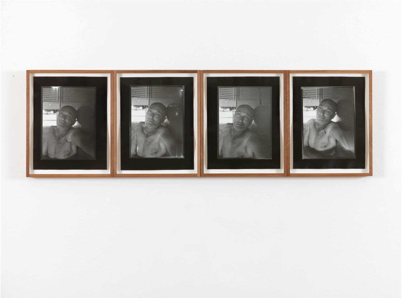
Self portrait , 2001, 4 b/w photographs, cm.30,5x24 each, Ed.of 3

"I photographed myself with a wooden camera that I placed on the floor, for I had no tripod for it. To be able to shoot myself, then I had to lie down beside it on the floor. The lens had a cover that has to be moved to expose the negative. I did that by stretching out my left hand."