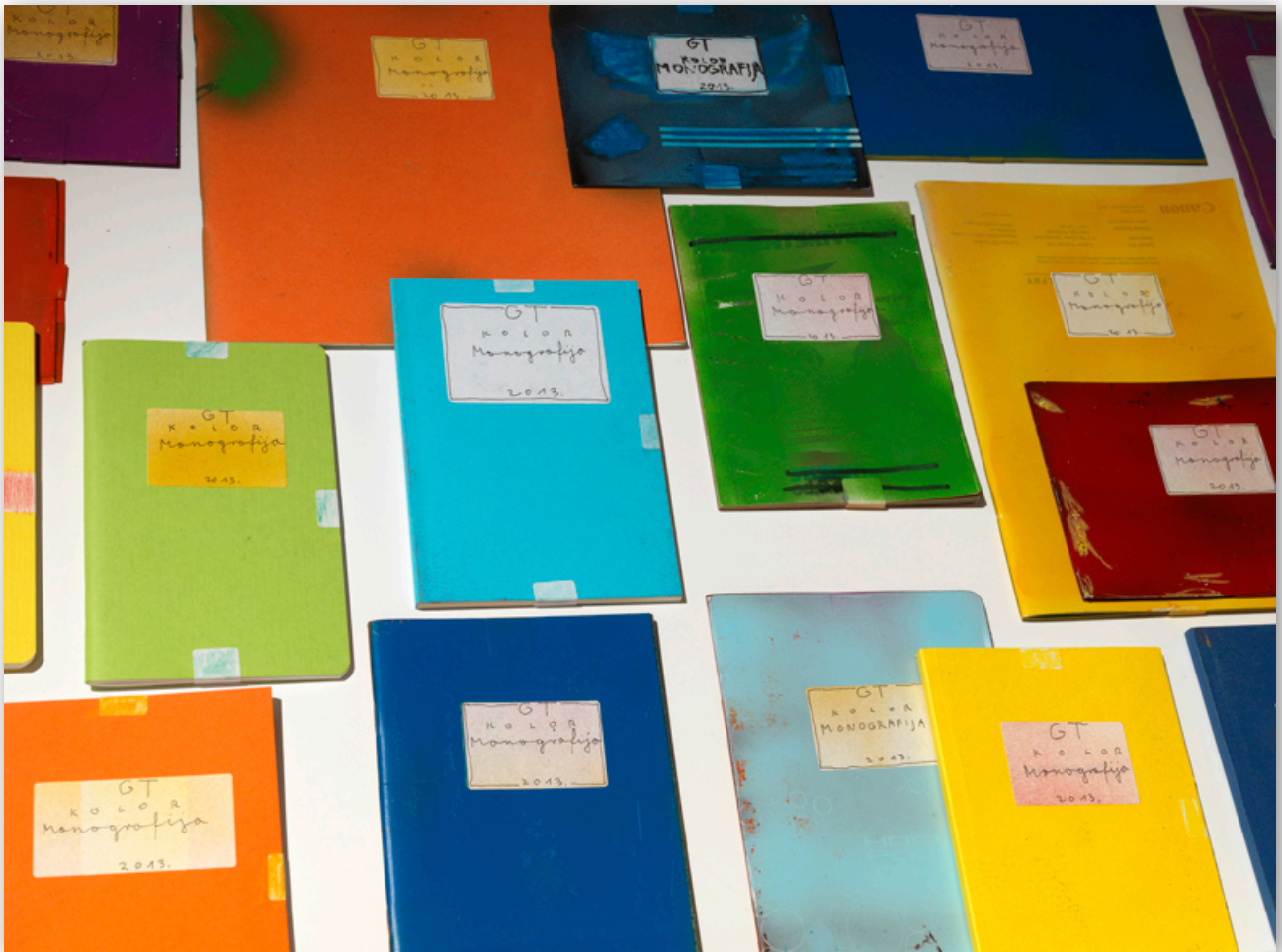
150 hand-made monographs, 2010–2013, variable dimensions

"I'm doing a thousand handmade monographs, and waiting to have the thousand plus one printed version."