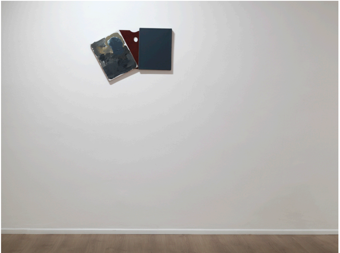
Hand held painting , 1993, acrylic on double canvases and wooden palette, 45x70 cm.

"I painted a monochrome painting (on the right) using the canvas as a palette (on the left)."