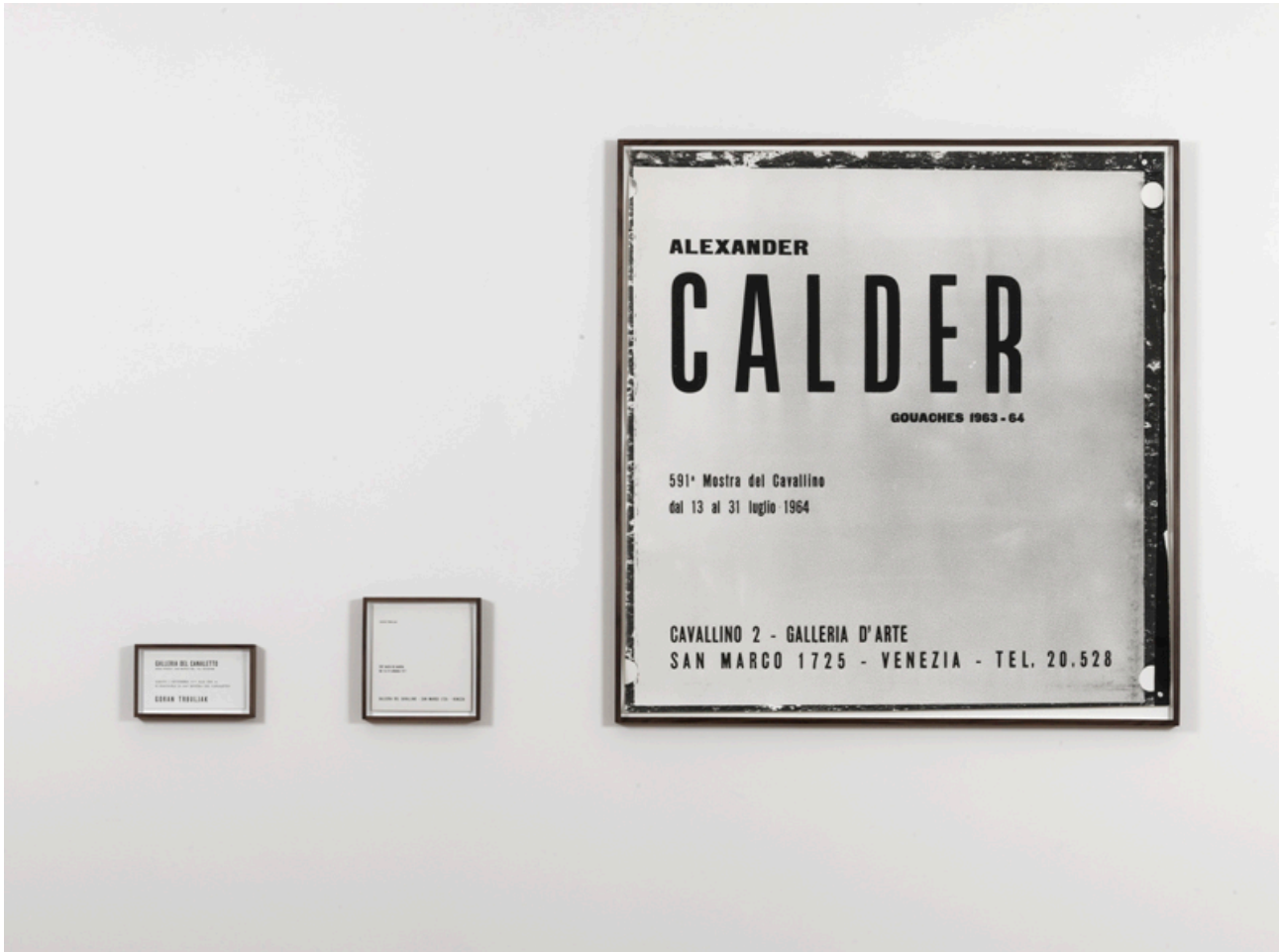
Invitation card, catalogue and photo on paper, 1977, various size

"Three works: invitation. catalogue and exhibition, which show possible relations between the name of the artist and the name of the gallery.